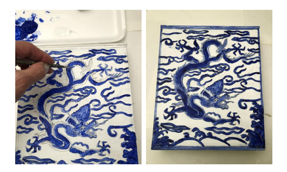
Paint the geometric designs on the sides of your box.