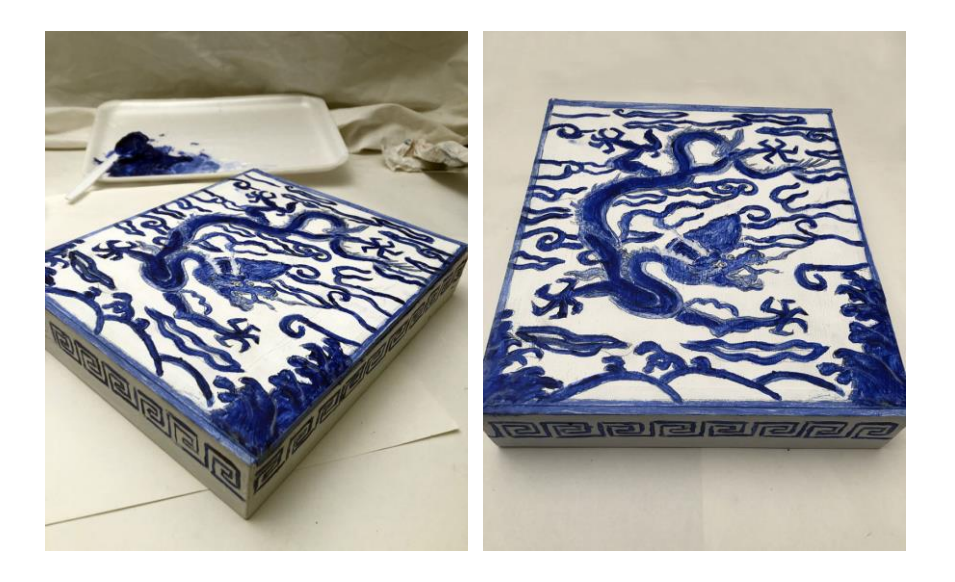
Take a photo of your work and share it using #GardinerFromHome .